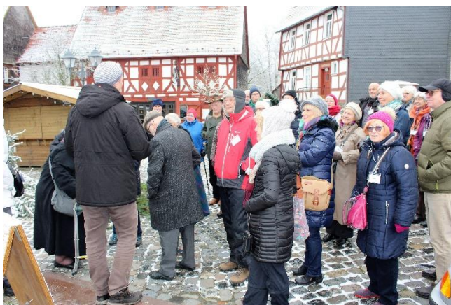
This was followed by lunch in Landgasthof Saalburg.