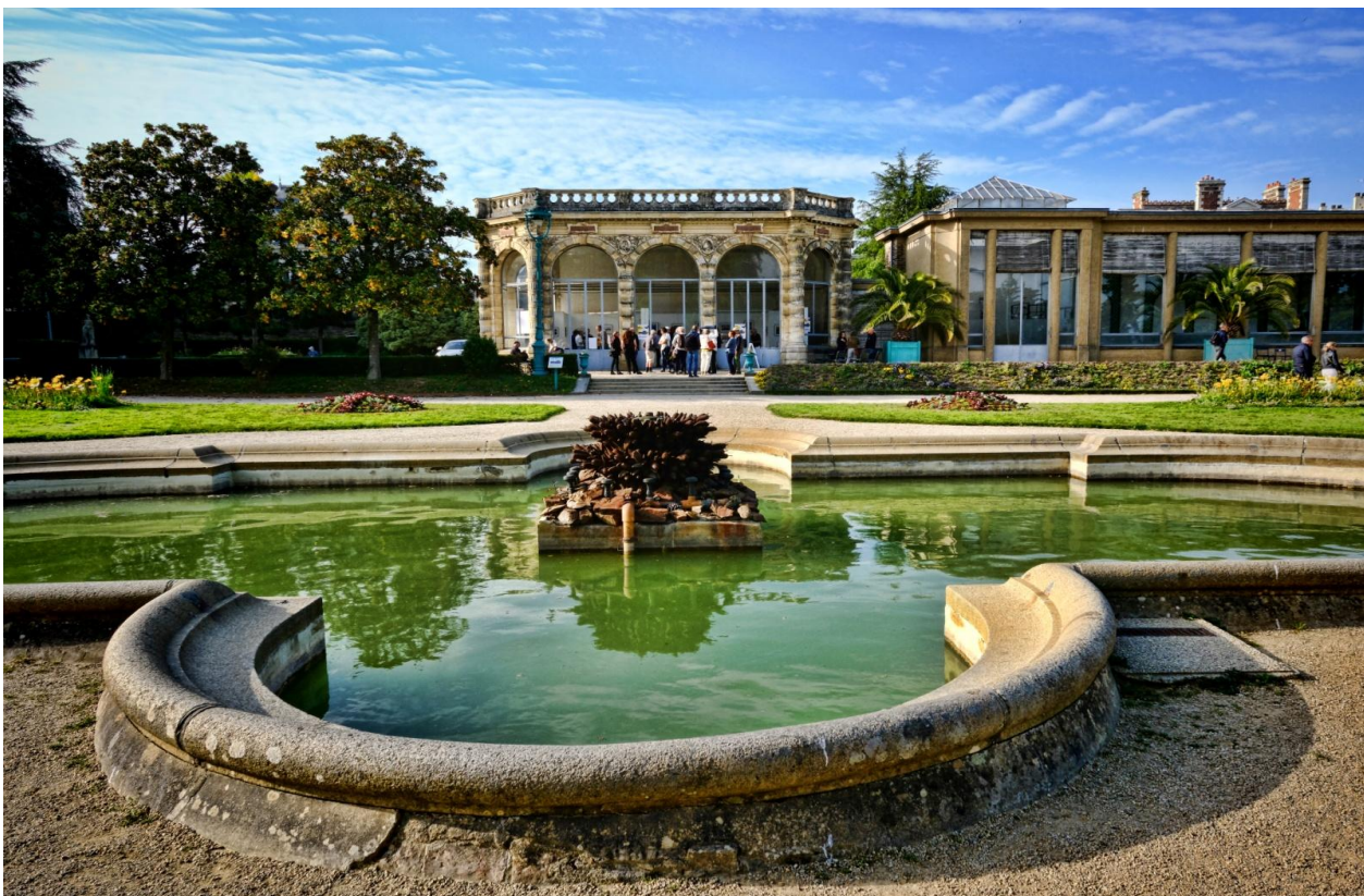
The Orangerie at the beautiful garden of Thabor – a fine venue for the exhibition.